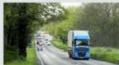
Fife Council has saved £200,000 on fuel

"Hopefully, we can achieve similar results."