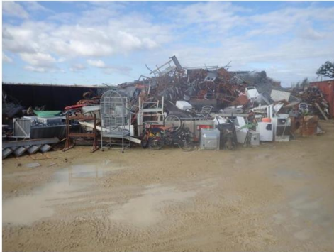
A mountain of waste found at the Stanford in the Vale site.