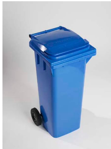
Paper & Card