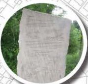
Potential interpretation board highlighting aims of the climate resilient park and SuDS works