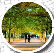
Indicative image to show potential for additional avenue trees along path