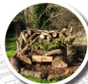
Log pile hibernacula to support ecological interest within site