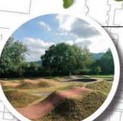
Potential Bike/BMX track