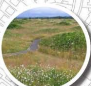
Potential wildflower play mounds set adjacent to Menthith Park to provide play and visual interest. Mounds constructed from site won material where reasonably practicable