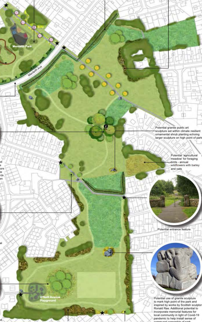
Potential granite public art sculpture set within climate resilient ornamental shrub planting echoing larger sculpture on high point of park