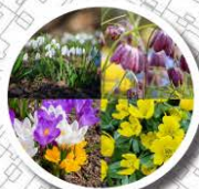
Indicative nectar rich bulb planting either side of reinforced grass path along top of SuDS basin bund