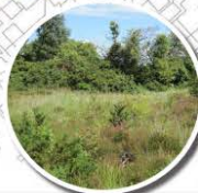
Potential native scrub planting to increase habitat cover and support biodiversity