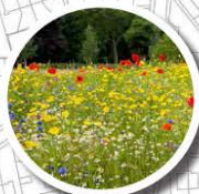
Potential aspiration to create wildflower meadow serving to enhance biodiversity and visual amenity. The reduced maintenance demand of wildflower meadows also feeds into climate resilient design as reduced carbon footprint from limiting mowing, strimming and maintenance vehicle movements