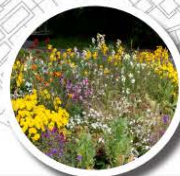
Climate resilient ornamental and tree planting to provide soft separation between play area and parking area