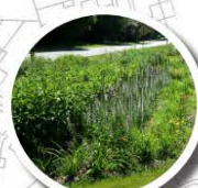
Potential marginal aquatic and wetland grass species within linear SuDS swale features supporting water flow, visual amenity and biodiversity