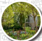
Potential climate resilient focal garden inspired by the Forestry Commission's The Resilience Garden, which celebrates plant species that are likely to perform important functions as climate changes. Includes specific interpretation boards to explain purpose and function of focal garden