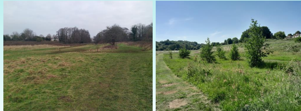
Ely Wells, before planting and three years on...