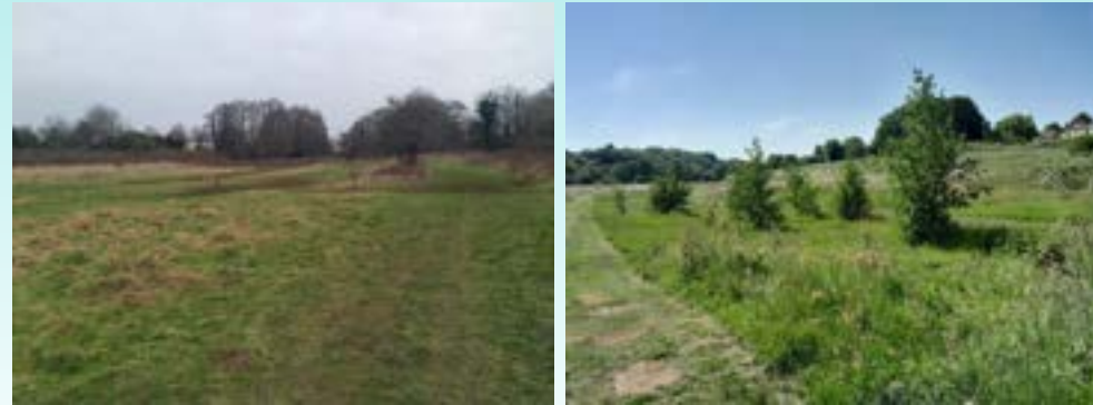
Ely Wells, before planting and three years on...