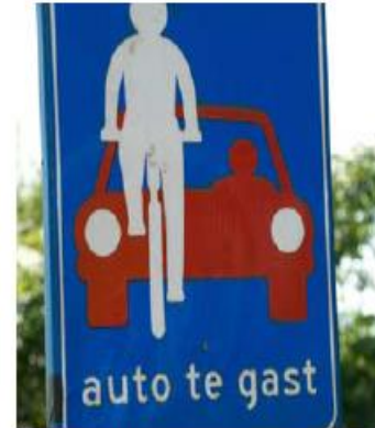
"the car is the guest"