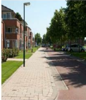
A40 Edge - hedging and avenue trees provide permeable green screen rather than a solid barrier