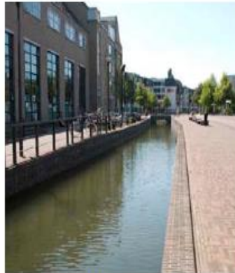
Water - permanent water feature / drainage in principal public spaces