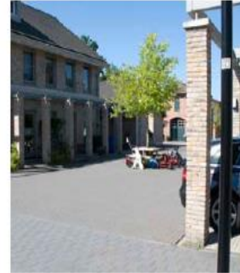
Play - smaller play spaces incorporated into public realm, parking courts become informal play areas and spaces to meet