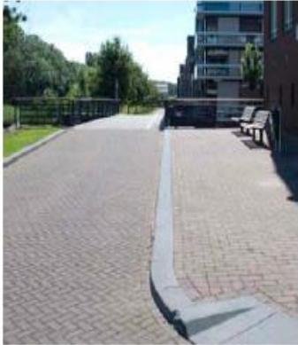
Paving - smaller paving units, creates a big difference to the character of spaces, more intimate