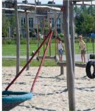
Play - simple play spaces, timber structures used to create a natural feel