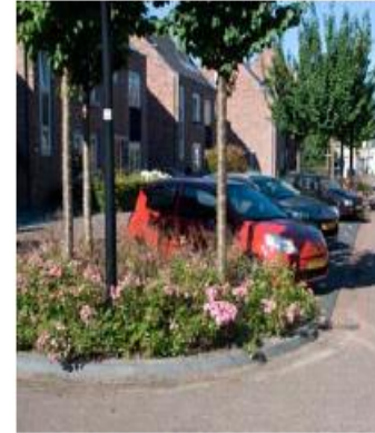
Parking - public parking courts, communal parking in addition to one parking space on plot