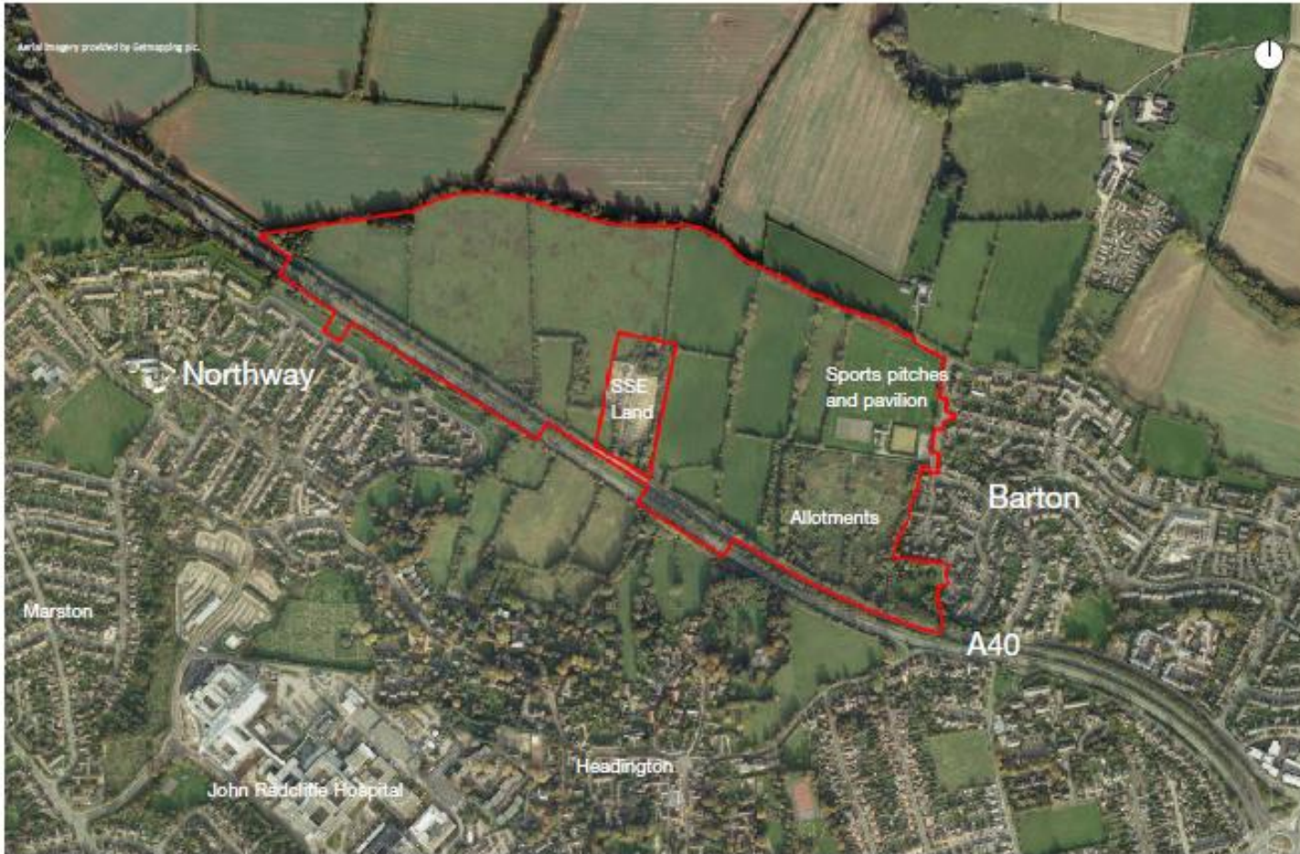
Figure 1. Aerial photograph (circa 2007) showing site boundary

EFFECTS OF THE PROPOSED DEVELOPMENT ON LANDSCAPE AND CULTURAL HERITAGE