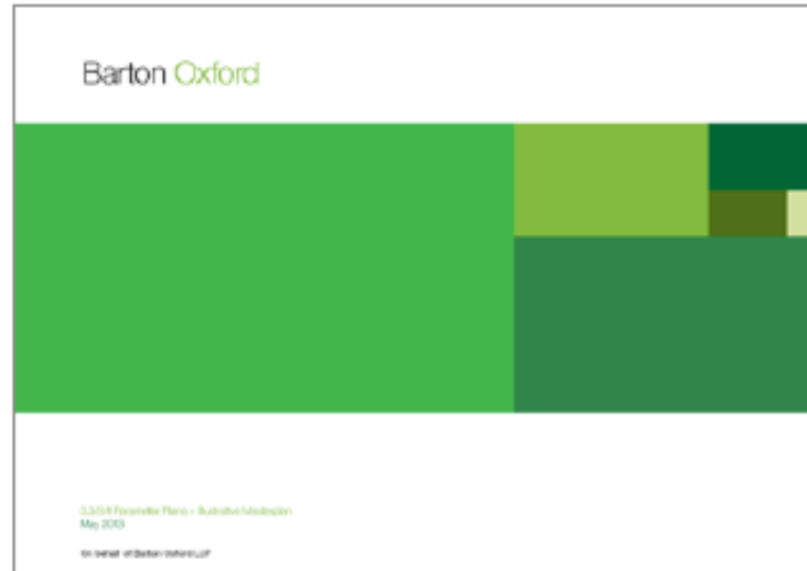
Parameter Plans + Illustrative Masterplan