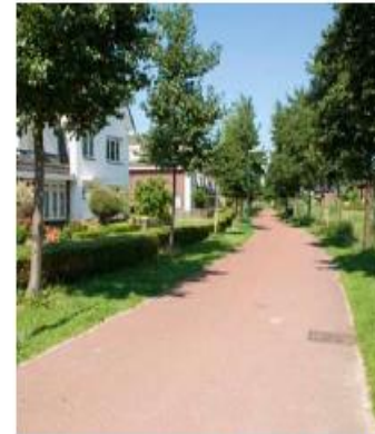
Landscape - generous use of hedging and tree planting, all of which is well maintained demonstrating civic pride