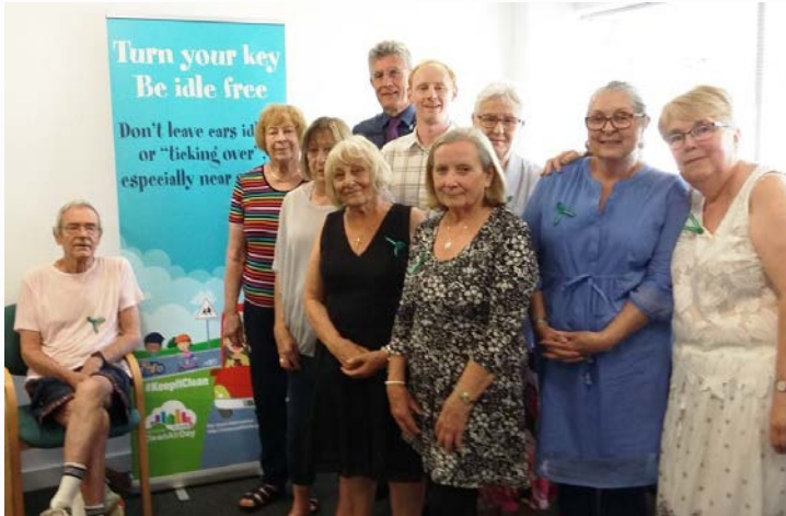
Breathe Easy group at Bishop's Stortford