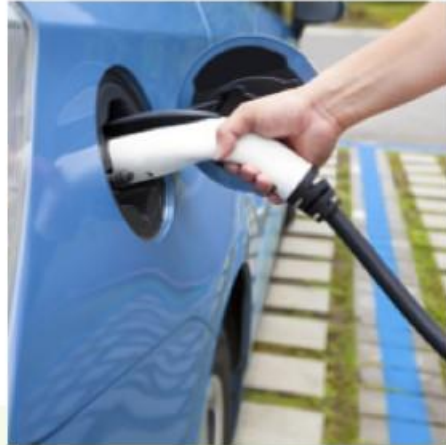
INSTALLATION OF EVC'S IN MARKET BOSWORTH, BARLWELL AND EARL SHILTON