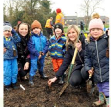
TINY FOREST PLANTING IN ASSOCIATION WITH EARTHWATCH