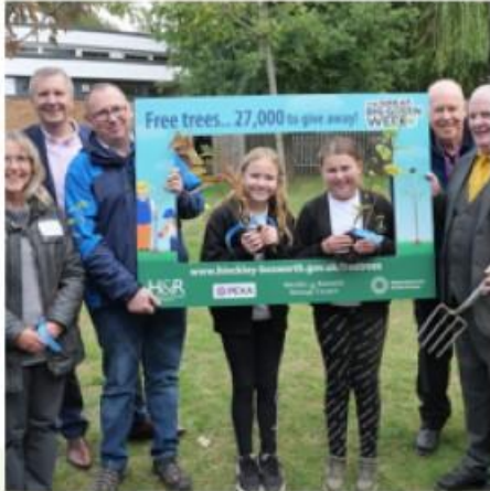
LAUNCH OF 27K FREE TREE GIVE AWAY