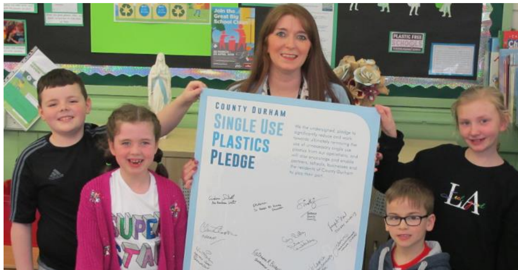
St Bede's RCVA Primary School, Sacriston