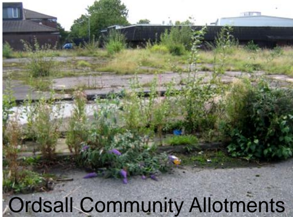
Ordsall Community Allotments