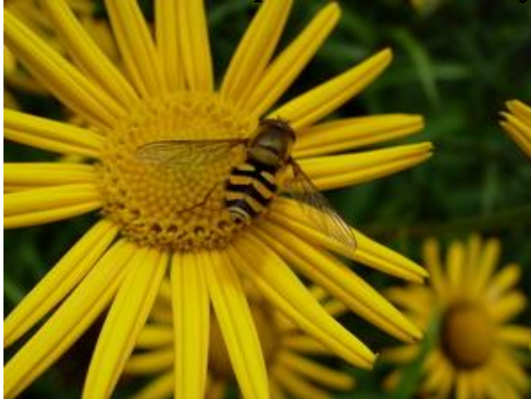
Adult hoverfly – vegetarian, likes pollen and nectar