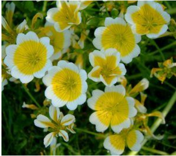
Poached egg plant (Limnanthes)