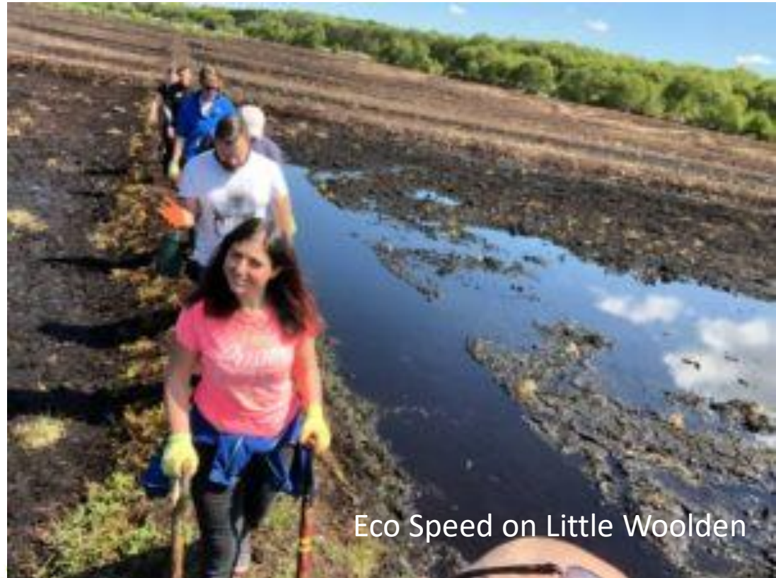
Eco Speed on Little Wooden