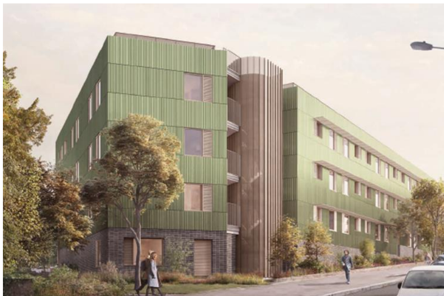
Millie Miller House, 2 Chester Road schedule for delivery in August 2026

Previously used as hostels for single homeless people