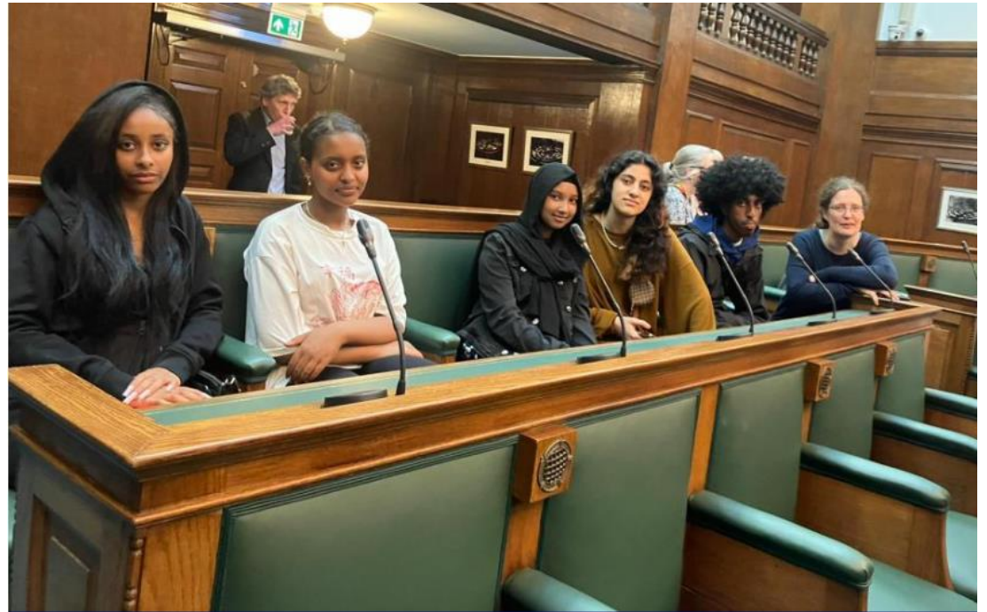
Young people from Doorstep, a charity working with people in hostels and temporary accommodation in Camden, tell councillors about the importance of free wi-fi in temporary accommodation

Avoid placing families in insecure, unsuitable accommodation, such as bed-and-breakfast hotels