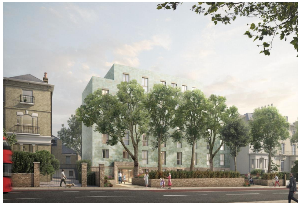
Kathlyn Oliver House, 248-250 Camden Road scheduled for delivery in September 2026