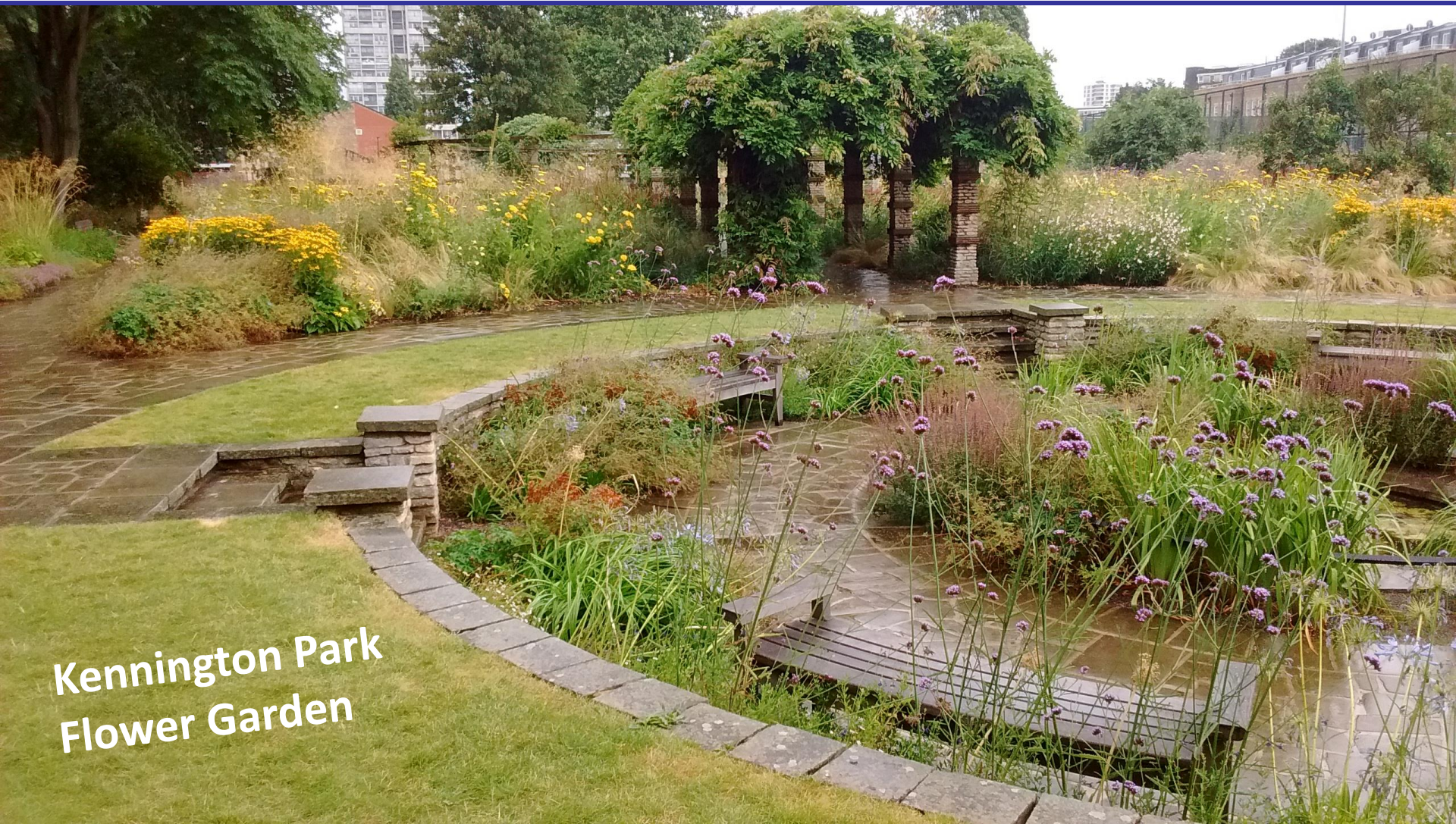
Kennington Park Flower Garden