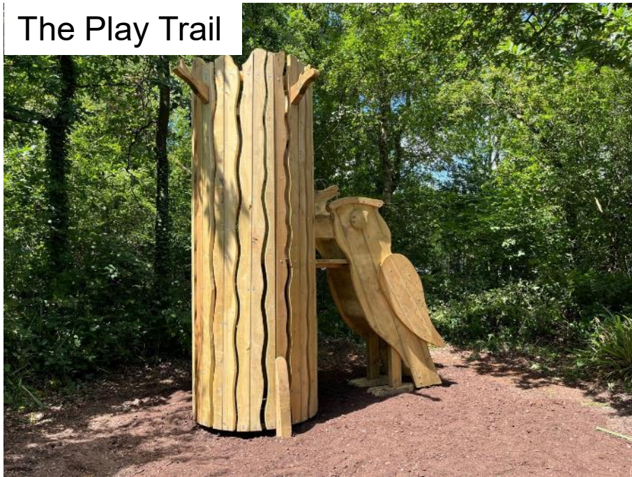
The Play Trail