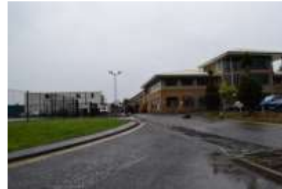
New West Fife Depot, Halbeath, Dunfermline £5.5m