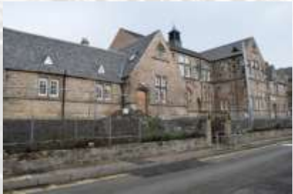
Refurbishment of an existing primary school to form social housing at Burntisland £5m