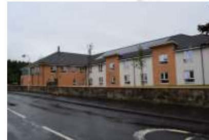
New Care Home and Extra Care Home £12m