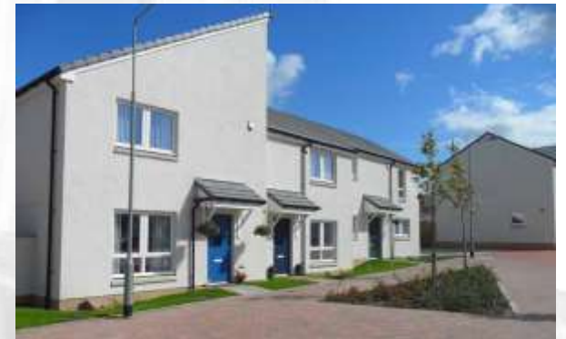
New Build Housing Programme £142m