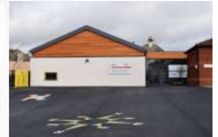
New Build Nursery Pathhead Primary School, Kirkcaldy £1.2m