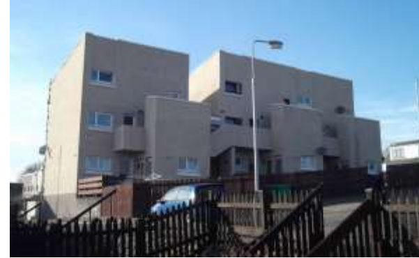
Component Replacement programme £33m