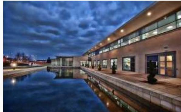
Bankhead Central Office £12m