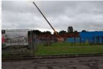
New Build Nursery Capshard Primary, Kirkcaldy £3.9m