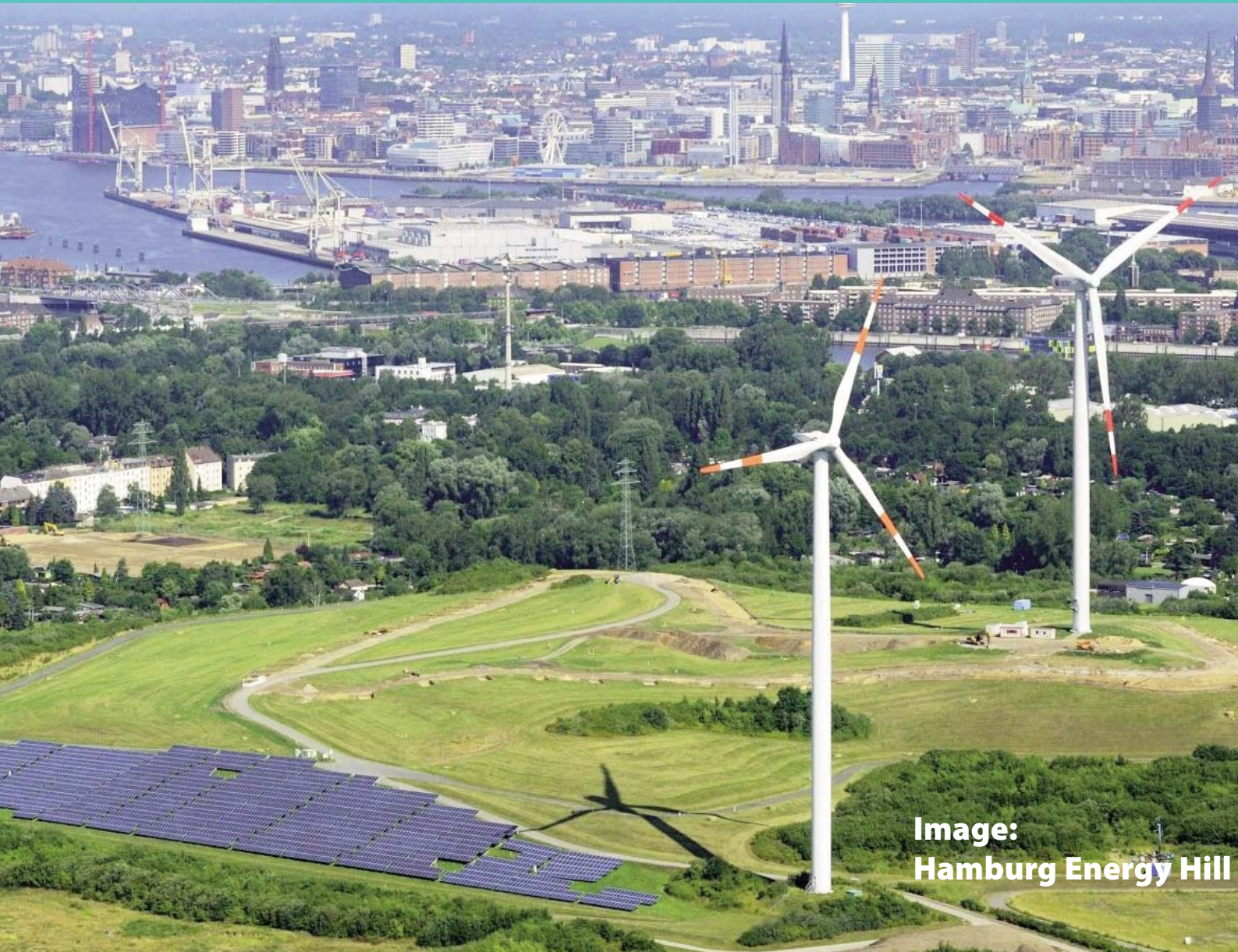
Image: Hamburg Energy Hill

Free event for members of APSE Energy and the Derbyshire and Nottinghamshire LAEP