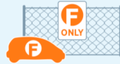
Light/Medium Duty Fleets