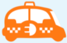
Charging Hub for Car Sharing Applications