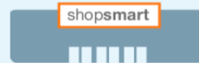
Retail and Restaurant Locations