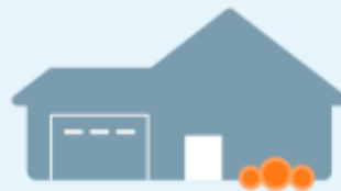
Single Family Homes