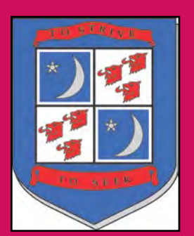
BALWEARIE HIGH KIRKCALDY