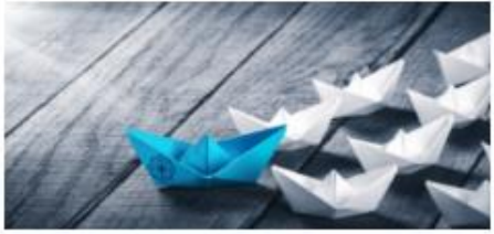
Leadership and Management Skills (CPD)