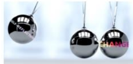
Coaching and Mentoring Skills for Councils