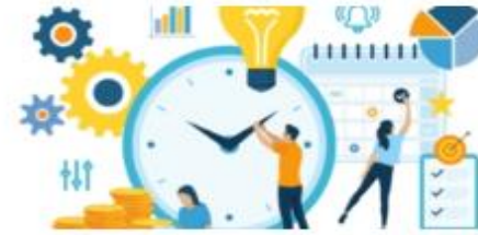
Effective Time Management for Local Authorities