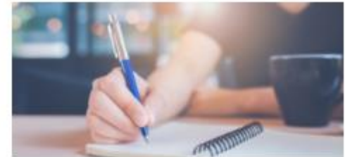
Improving your Written Communication Skills