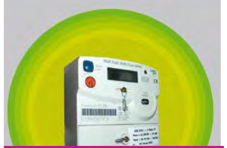
Waste: A brave new world