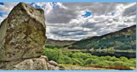
Bruce's stone above Loch Troof, Galloway Forest Par

Barony College and the Crichton University Campus, the UK's first multi-university campus, hosting the Universities of Glasgow and West of Scotland as well as Bell College.