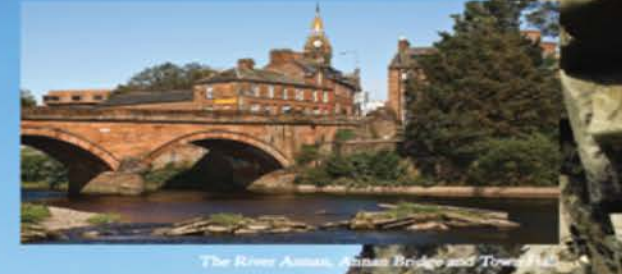
Dumfries & Galloway's to the and severaphy never fails to amaze to be who experience this gorgoous region.

In Dumfries and Galloway you are never far from water. Inland Galloway Hills are scattered with lochs and breathtaking waterfalls. One of our gems is the Solway Firth, a unique coastline, wild, exposed, stunning and a major attraction to visitors from all over the world.