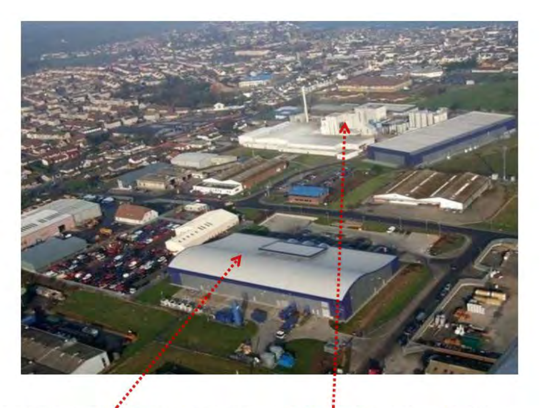
Stranraer Sites MCP (Packing) and CCC (Production)