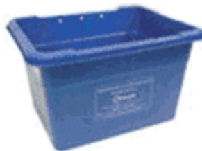
Glass and cans