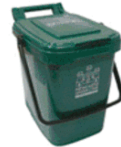
Food waste (kerbside)