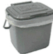
Food waste (kitchen)