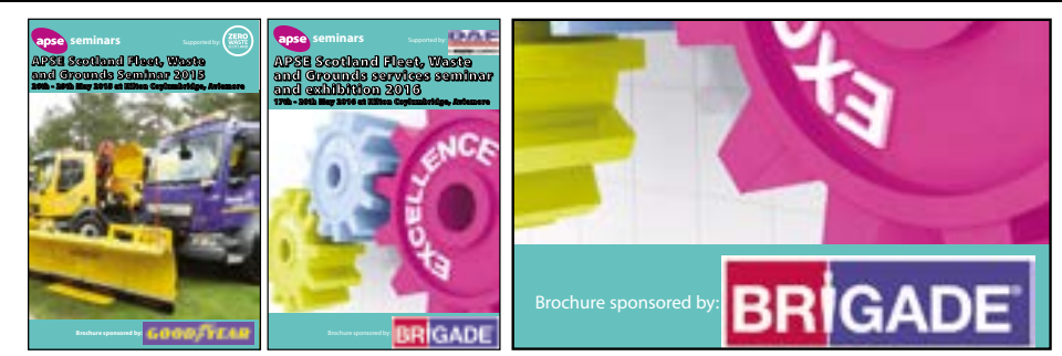
Examples of previous conference brochure sponsors