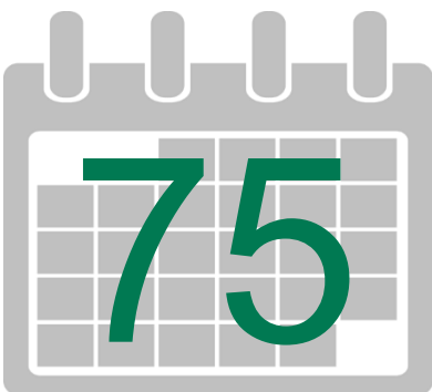
Potential Members (1000)