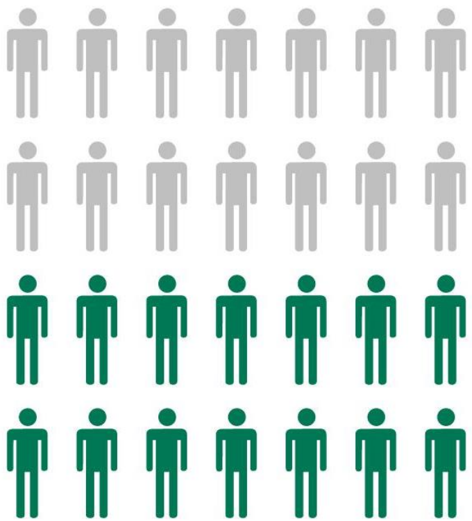
14 Staff Members