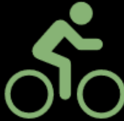
Travel & transport