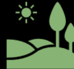
Land use, green space and development