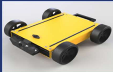
HADES-5 Vehicle inspection and scanning robot