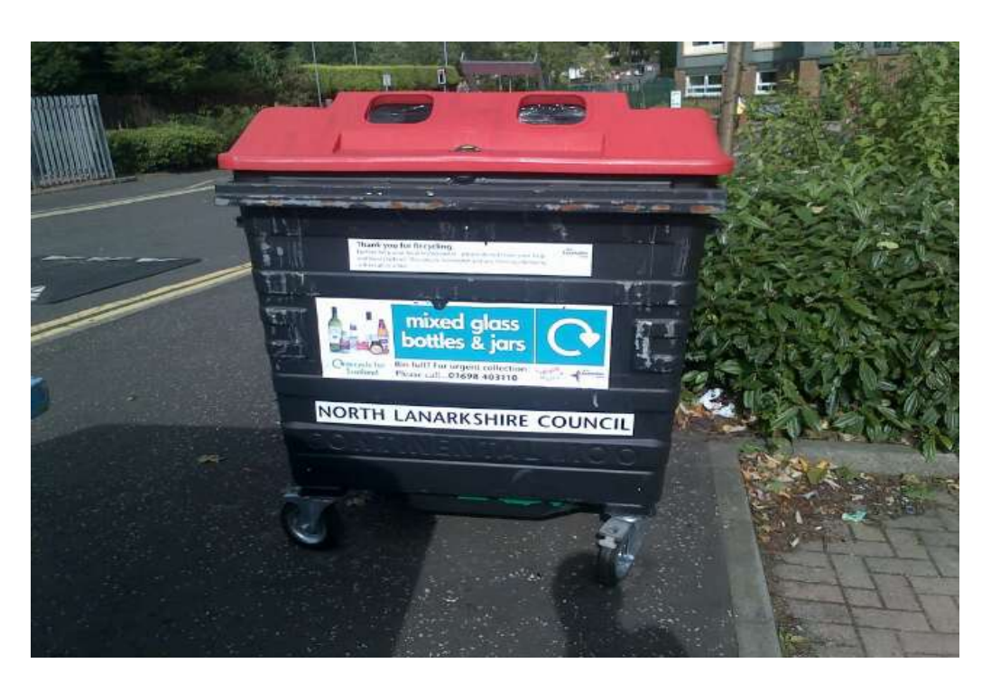
Front of bank showing signs of wear and tear