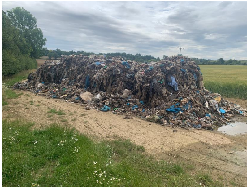
Waste Deposit- Leadenham (Farmland 40 Tonne Deposit)