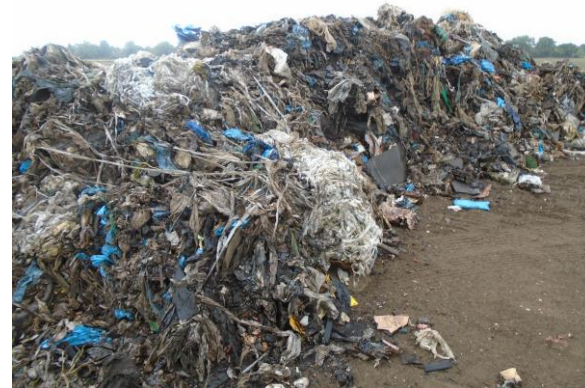
Waste Deposit- Norton Disney, North Kesteven (Farmland 40 Tonne Deposit)