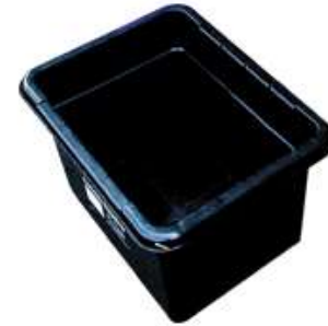
Glass & Cans