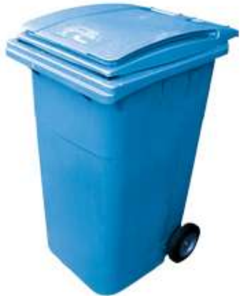
Paper & Cardboard