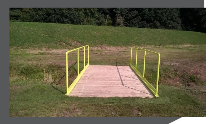
Construction/ maintenance has grown from £50k to £450k per year.