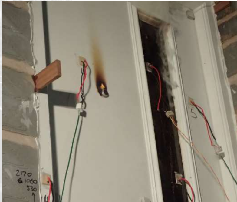
Doorset A after 38 Minute