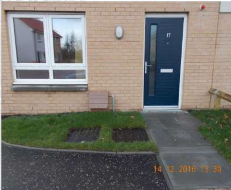
New Build Rosslyn Street Kirkcaldy