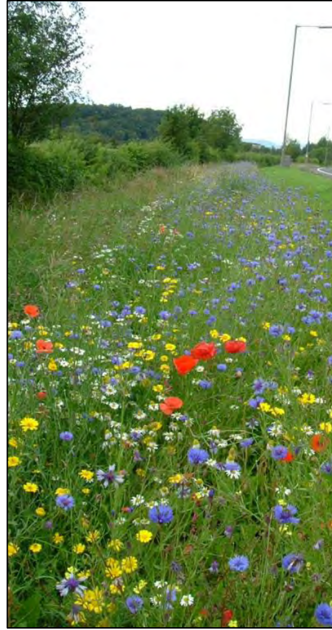
Year 1 - Annuals