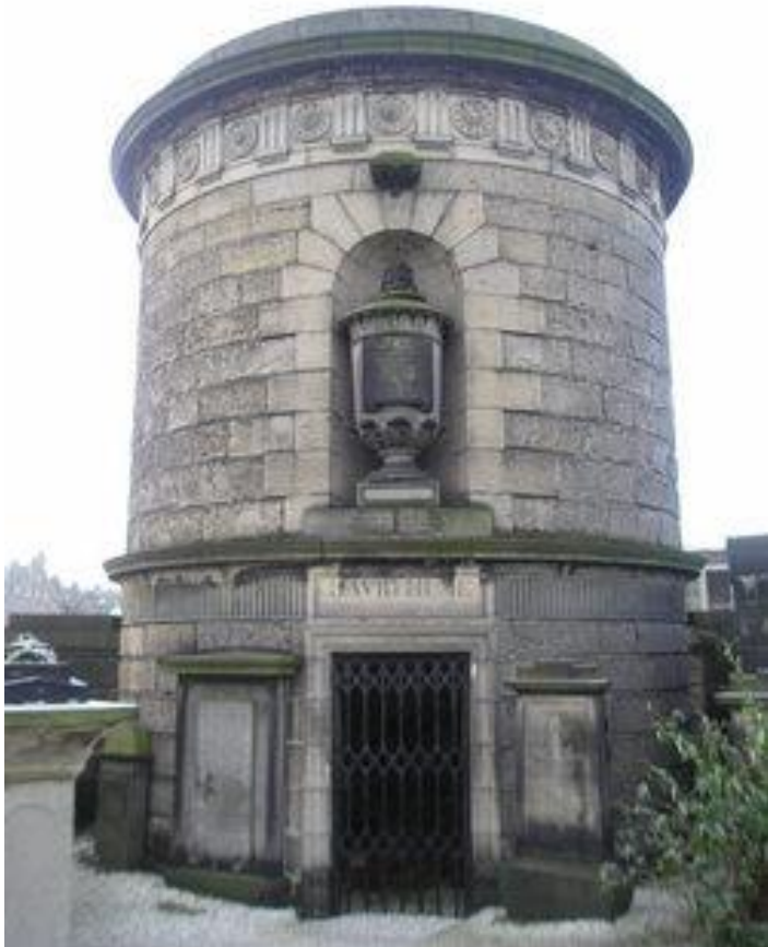
Old Calton Burial Ground