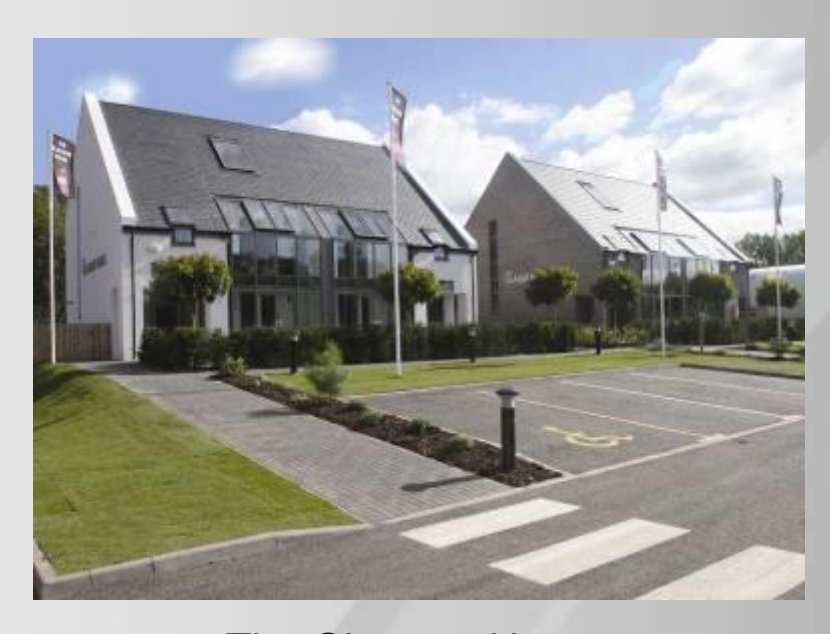
The Glasgow House