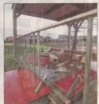
Broken by mindless vandals after just two days

Anyone who can help trace the vandals should call 0141 535 5600.