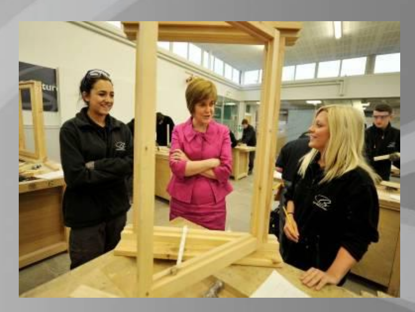
Nicola Sturgeon, Deputy First Minister with micro-renewable apprentices