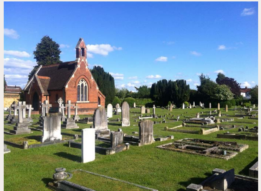
Old Windsor Cemetery