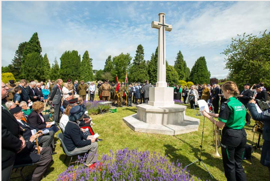
Tunbridge Wells Cemetery

Living Memory project – run in 2016 to encourage members of the public to visit war graves in the UK.