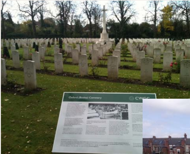
Oxford (Botley) Cemetery