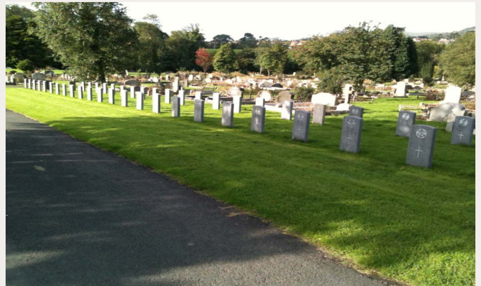
Belfast City Cemetery