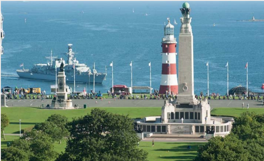
Plymouth Naval Memorial