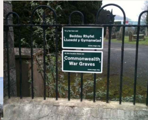
Pembroke Dock (Llanion) Cemetery