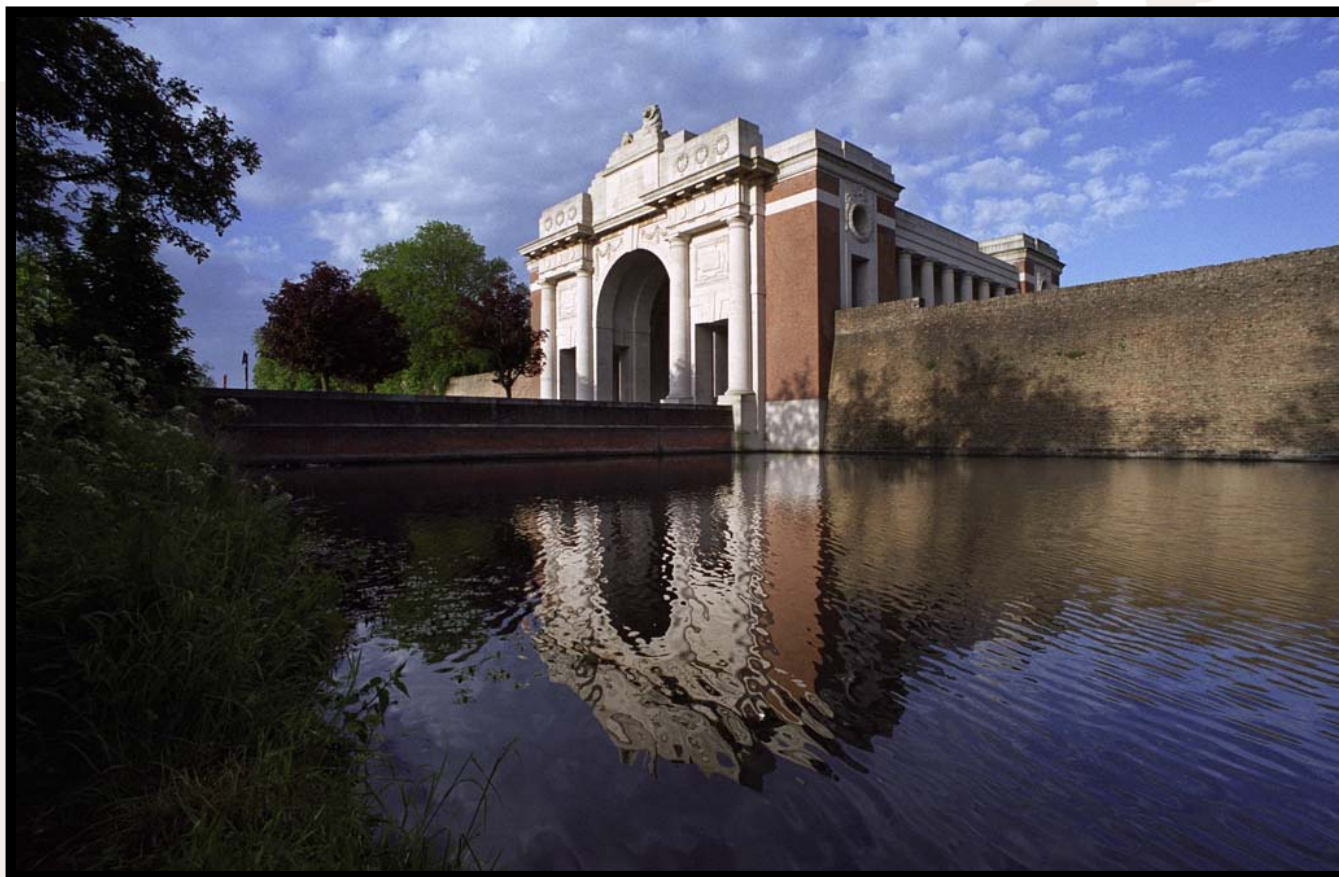
Menin Gate Memorial