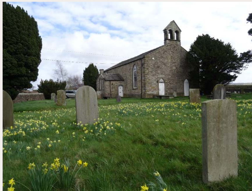
Shireshead (St. Paul) Churchyard