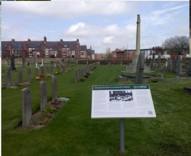
Newcastle (St. Andrews and Jesmond) Cemetery