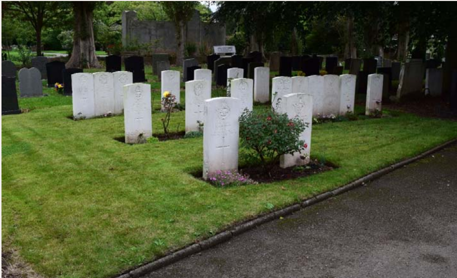
Coventry (London Road) Cemetery