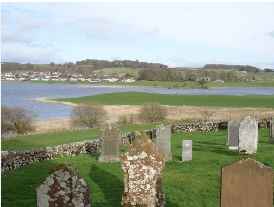
Balmaghie Parish Churchyard, Orkney

...and individual graves in local churchyards.