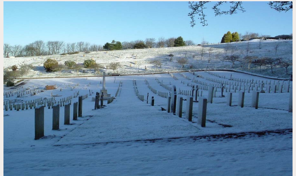
Shorncliffe Military Cemetery