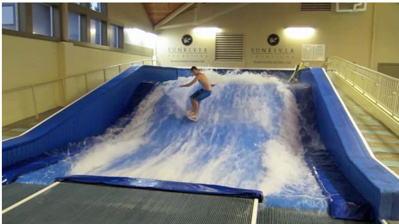
Indoor / outdoor water sports