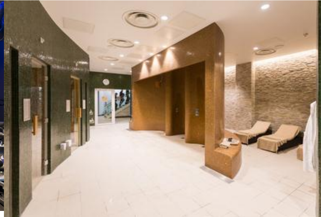
High quality Spa facilities