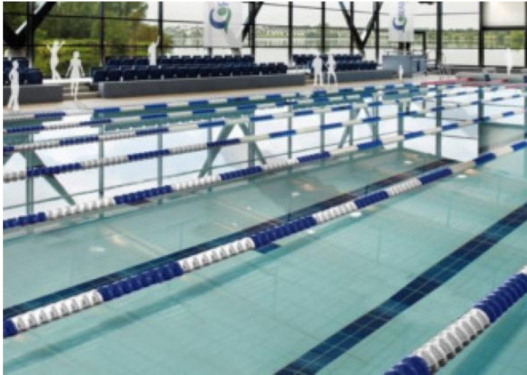
50 m pool and wet play