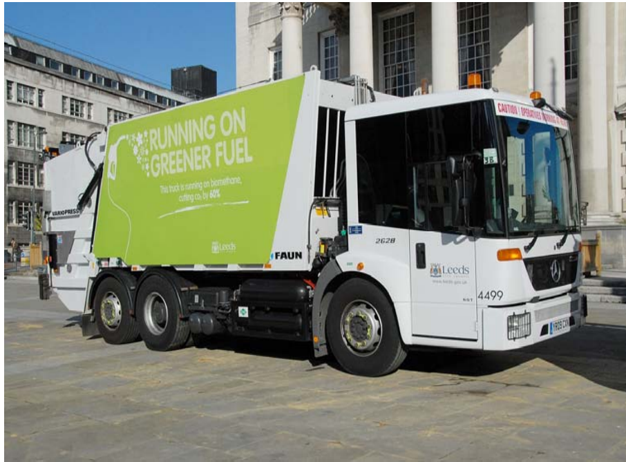
Gas refuse vehicle