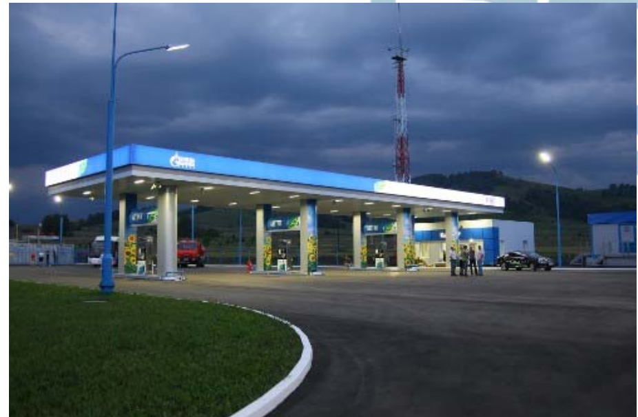
CNG Station for Leeds