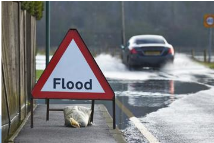
Flooding and water quality