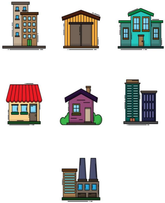
Over 200 buildings