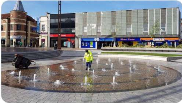
Stockton BID and 2 others

One of the things I like about #Stockton: even in the midst of #StormAli (and it's *very* blowy here just now) there is someone picking up debris from the fountains to ensure that the town looks its best. Investing in top-notch public realm - and then maintaining it - is key!