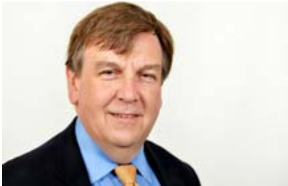
The Rt Hon John Whittingdale MP Secretary of State for Culture, Media and Sport