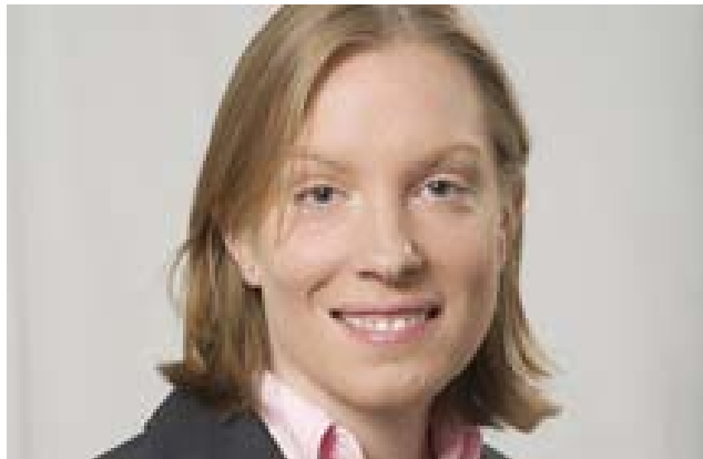
Tracey Crouch MP Parliamentary Under Secretary of State for Sport, Tourism and Heritage