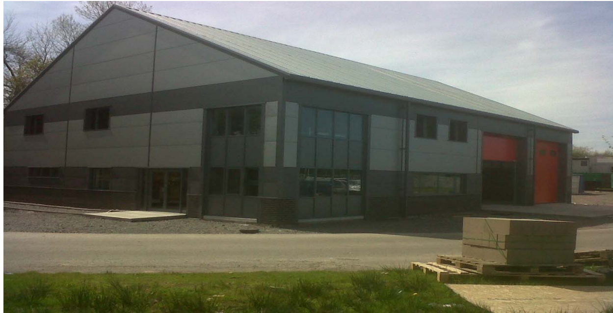
New Scottish Fire and Rescue Service Training Centre