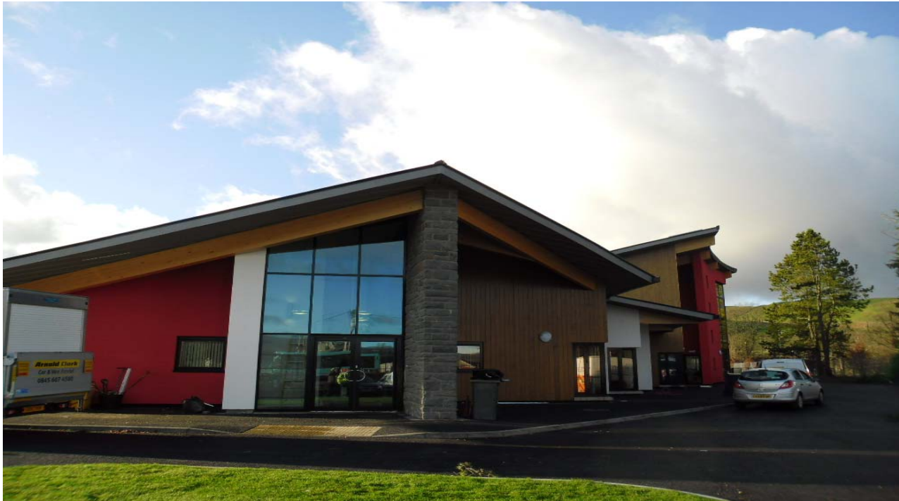
Beattock Primary School