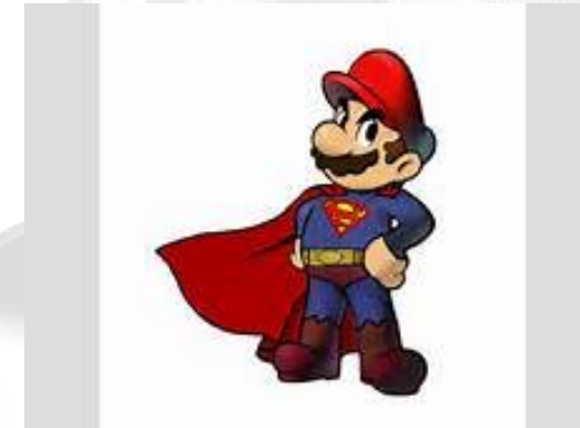
Super Mario, Plumber