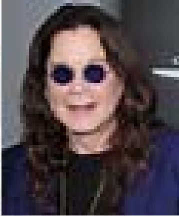
Ozzy Osbourne, Apprentice Plumber