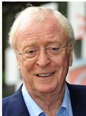
Sir Michael Caine Apprentice Plumber