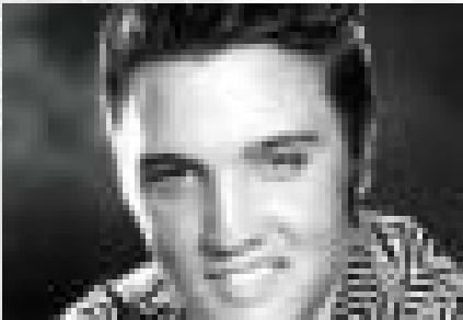
Elvis Presley, Apprentice Electrician