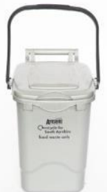
23 litre Weekly