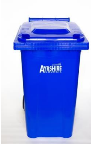
240 litre 4 weekly