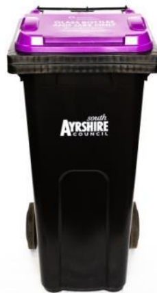
140 litre 6 weekly