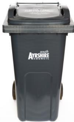
180 litre 4 weekly