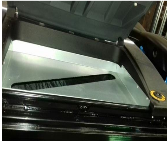
Paper & Card