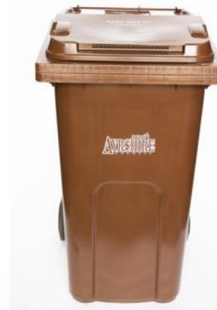
240 litre 4 weekly