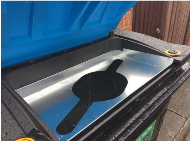
Plastics, Metals, Cartons