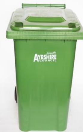
240 litre 3 weekly