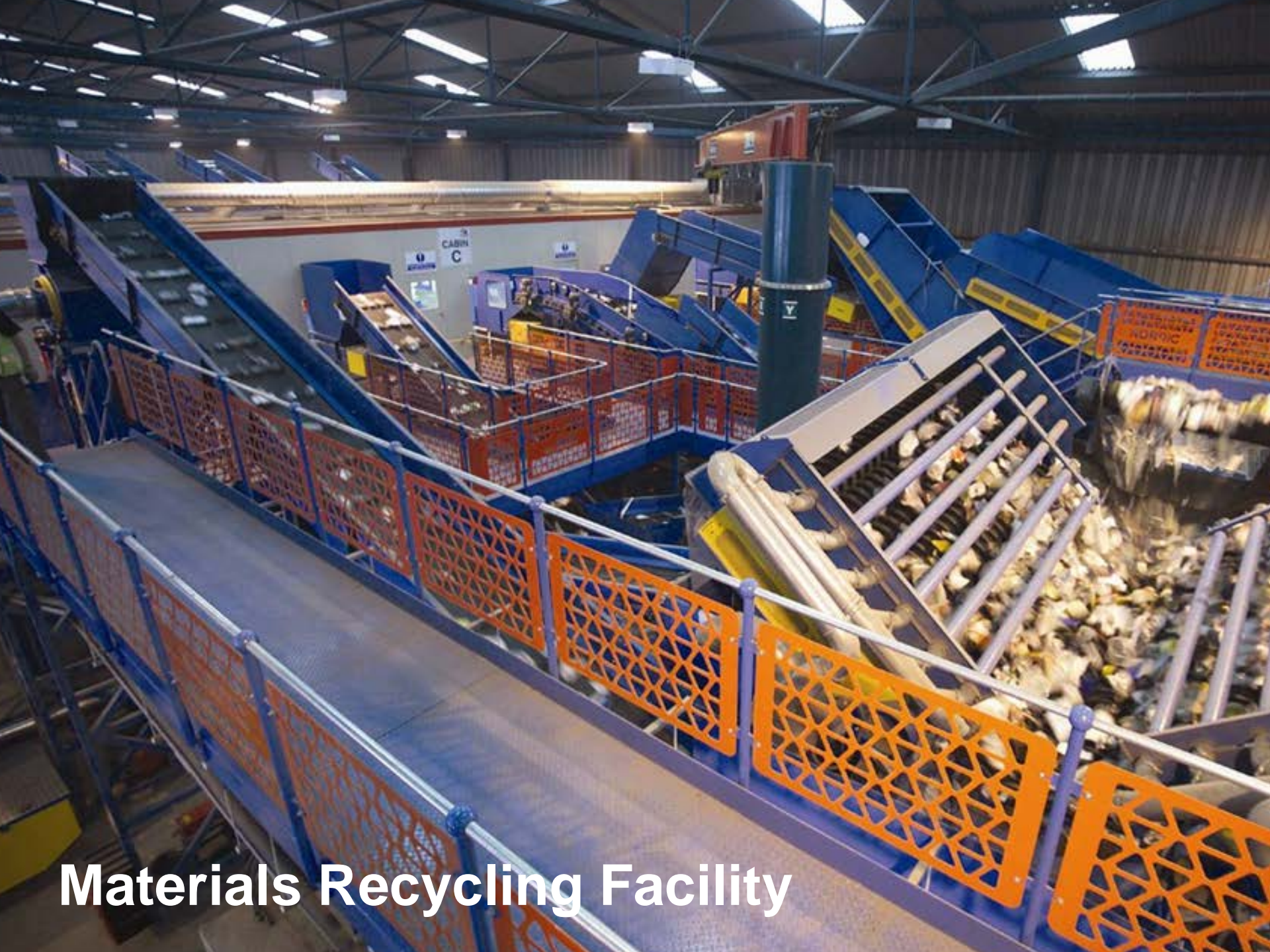
Materials Recycling Facility