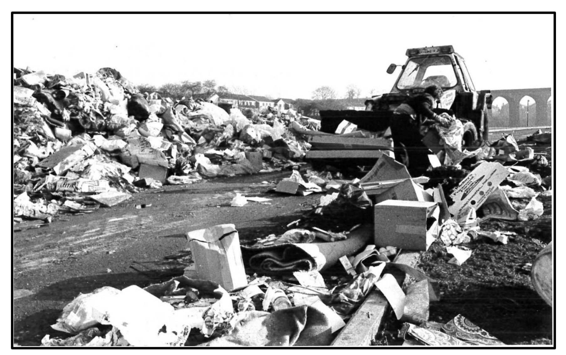
February 9th, 1979