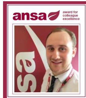
Ansa Ace Scheme Launched