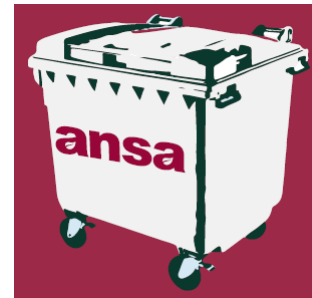
Trade Waste Collection