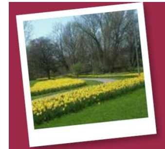
One Million Bulbs Planted Across 100 Sites