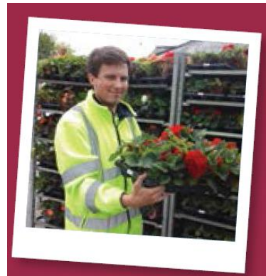
First Apprenticeship Open Day