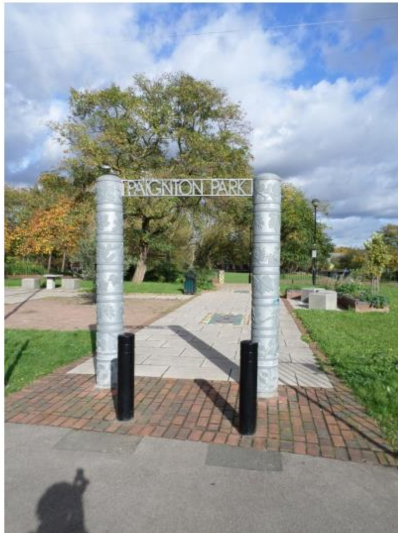
Paignton Park Management Plan 2015